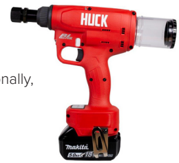
The Huck Range Force Battery Tool

2000/53 Annex 2 in materials and components of vehicles. Additionally, it also meets the requirements of the Restriction of Hazardous Substances regulations.