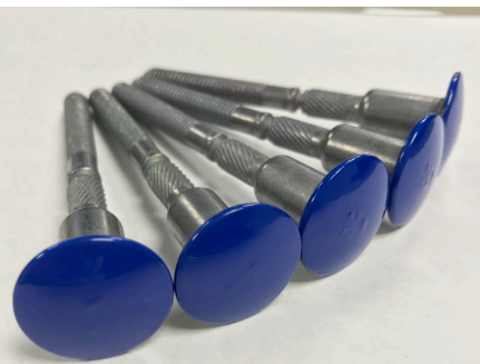
Powder Coated Hucktainers

The encapsulated headed Hucktainer®, is available in any colour head. "The encapsulated Hucktainer has been available on the market for many years," reports Daniel. "Customers were contacting us saying that they wanted to use colour matched fasteners on pre-coloured composite panels - this is the ideal solution.