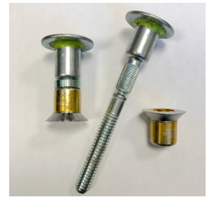
Countersunk Hucktainer Collar

Star Fasteners can colour match to hundreds of different colours, but we also stock a wide range of standard colours ready for dispatch."