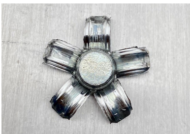
Huck Penta-Lok key feature, wide load spread (installed blind-side view)

The Huck Penta-Lok is an easy-to-install, 6.4mm diameter, all steel (body and mandrel) plated, peel structural fastener with superior blind side strength.