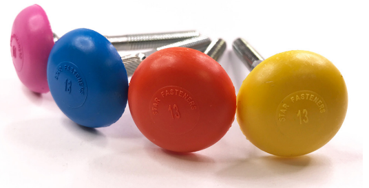
IDENTIFICATION ON SLEEVE HEAD