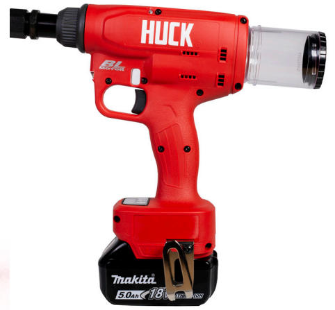
Huck Range Force™ Battery Tool