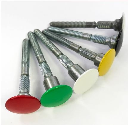
Powder coating service