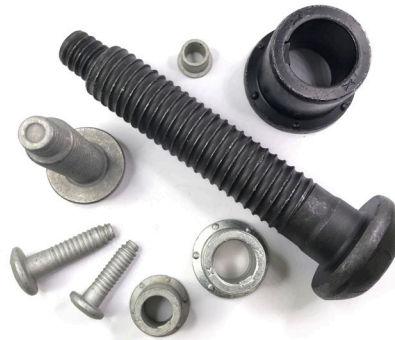
Huck® BobTail® - various sizes and finishes available

Huck fasteners offer a clean and safe alternative to welding and a more efficient fastening method than standard nuts and bolts, they have additional advantages such as, quick and easy installation, elimination of re-checking / replacement, and ultimately cost reductions. For years, welding was seen as the only way to ensure the integrity of joints in demanding load-bearing or high-vibration structures; companies manufacturing heavy-duty equipment or fabricating large, metal structures continued to employ the universally accepted process of welding joints together. However, today there are alternatives to welding, one of the foremost being direct-tension installed, swaged Lockbolts, such as the HuckBolts®. Each Huck Fastener has its own unique characteristics ensuring that there is a product for every application.