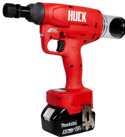
Huck Range Force Battery Installation Tool

Huck® fasteners provide strong and reliable joints, often with load-carrying capabilities comparable to or even exceeding traditional fasteners. 316 stainless steel offers high tensile strength and durability, allowing fasteners to withstand significant loads and stresses.